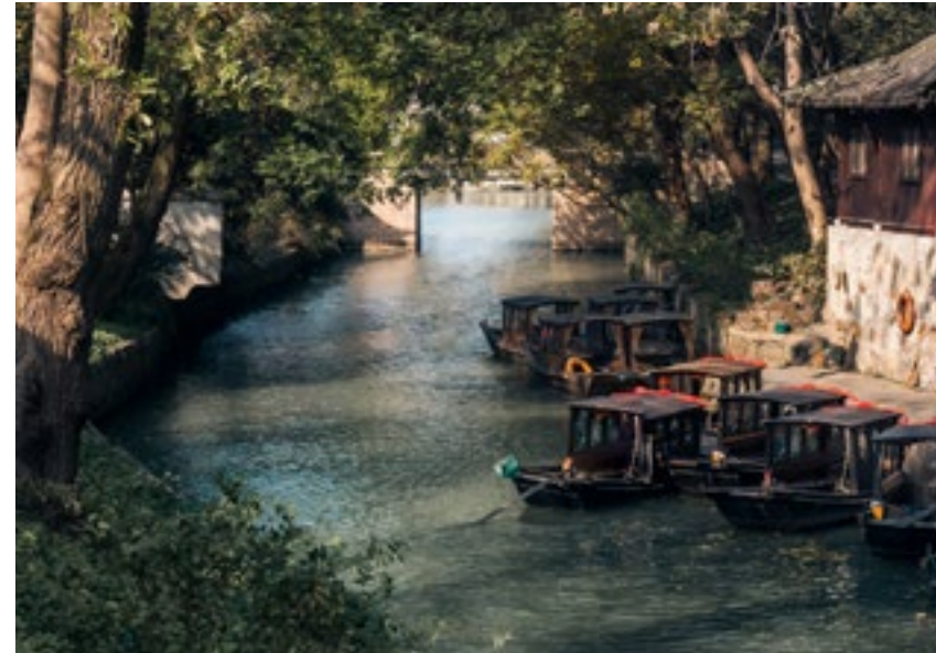
CLOCKWISE FROM TOP: The charming city of Suzhou, known for its canals, bridges and gardens; Terraced tea plantations on the shores of Taiwan's Sun Moon Lake; The spectacular Red Torii Gates at Fushimi Inari Shrine. OPPOSITE: Beijing's incredible Forbidden City.