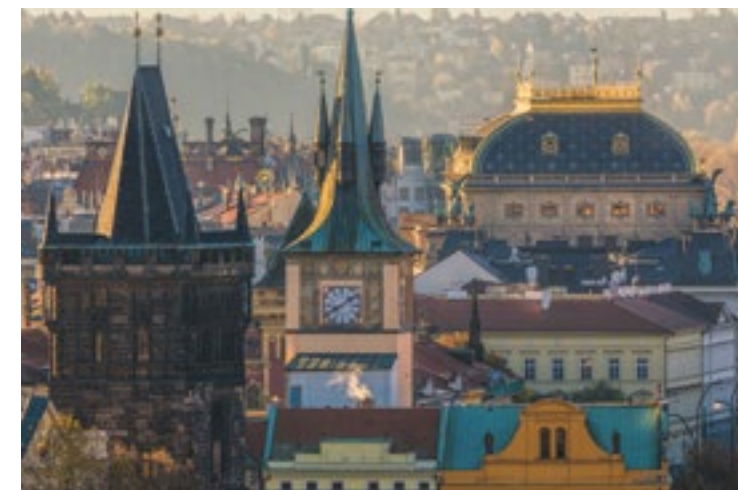
CLOCKWISE FROM TOP: If you haven't seen or climbed it yet now's the time; Venice's romantic Grand Canal; The spectacularly ornate skyline of Prague; Majestic Lucerne at dusk.