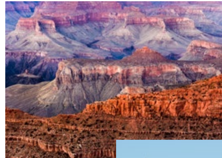
FROM TOP: America's breathtaking Grand Canyon at sunset; The US is famous for its big cities – admire the view from the Seattle Space Needle; Lake Louise in Banff, replete with gorgeous lakeside cabin. OPPOSITE: Cruising through Alaska's stunning glaciers is an unforgettable experience.

You'll visit Canada's iconic Banff National Park and tranquil Lake Louise, also known as the Jewel of the Rockies. You'll take in Jasper National Park, the largest in the Canadian Rockies blessed with stunning glaciers, lakes and mountain peaks, and spot grizzlies on an optional river cruise to Grizzly Bear Valley. Your Canadian adventure ends at Vancouver's Granville Island, where