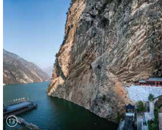
Images: 12. Yangtze River 13. Shore excursion 14. Yangtze Gold Cruise

A Yangtze River cruise is the thrill of a lifetime. You will enjoy the stunning picturesque scenery and amazing natural beauty of the famed Three Gorges: Qutang, Wu, and Xiling, while exploring historical relics and ancient cultural sites along the mighty river.