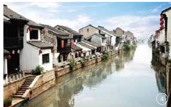
Images: 1. The Bund, 2. Tiananmen Square, 3. Summer Palace, 4. Wuxi, 5. Terracotta Army, 6. Suzhou, 7. Wild Goose Pagoda, 8. Great Wall, 9. Water Cube, 10. Enduring Memories of Hangzhou, 11. SPIRAL Acrobatic Show