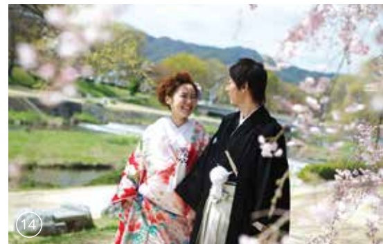
Images: 11. Toyko DisneySea, 12. Tea Ceremony, 13. Himeji Castle, 14. Kimono Photo Shoot