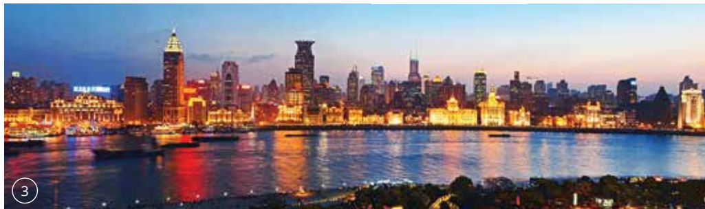
Images: 1. Wuzhen water town, 2. Xingping River Cruise, 3. The Bund, 4. Summer Palace, 5. Chinese acrobatic show, 6. Terracotta Army, 7. Old Town Shanghai, 8. Chengdu Research Base of Giant Panda Breeding, 9. Lingerin Garden, 10. Great Wall