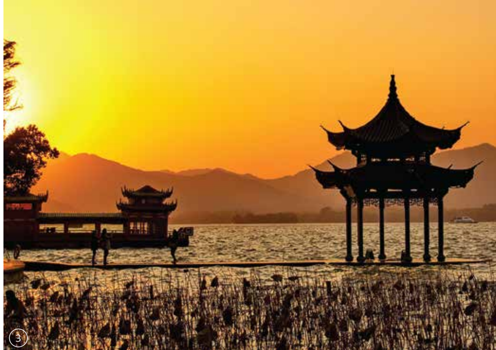
Images: 1. Forbidden City, 2. Great wall, 3. West Lake, 4. Wangfujing, 5. Tiananmen Square, 6. The Golden Mask Dynastsy, 7. Summer Palace, 8. Shanghai, 9. Terracotta Army, 10. Great Wild Goose Pagoda, 11. Impression of West Lake