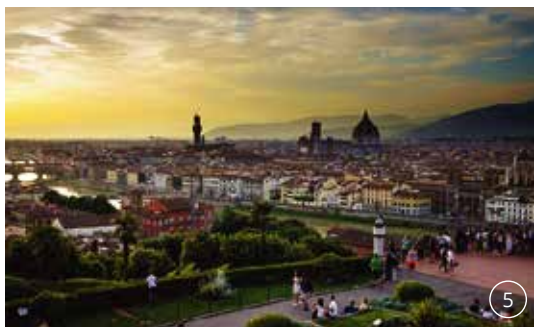
Images: 1. Piazza Dei Miracoli, 2. Prague, 3. Eiffel Tower & River Seine, 4. Cable Car to Grindelwald, 5. Florence, 6. Montmartre, 7. St. Peter's Basilica