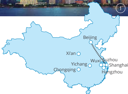
Images: 1. Shanghai city skyline, 2. Tiananmen Square, 3. The Golden Mask Dynasty, 4. ERA: The Intersection of Time, 5. Terracotta Army, 6. West Lake, 7. Lake Tai, 8. Giant Panda, 9. Impression West Lake, 10. Xintiandi, 11. Ancient City Wall