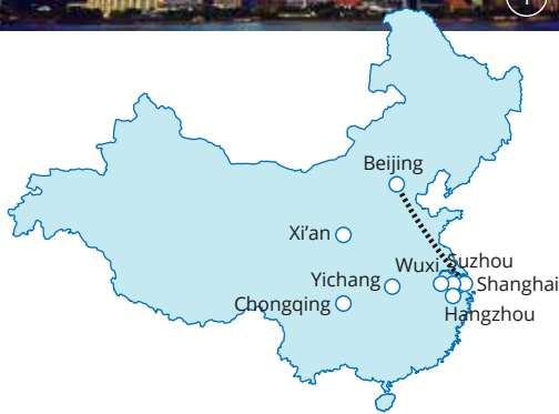
Images: 1. Shanghai city skyline, 2. Tiananmen Square, 3. ERA: The Intersection of Time, 4. Terracotta Army, 5. West Lake, 6. Lake Tai, 7. Giant Panda