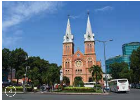
Images: 1. Saigon Post Office, 2. Hoi An Fishing Village, 3. Mekong River Cruise, 4. Notre Dame Cathedral, 5. Cu Chi Tunnels, 6. Ho Chi Minh's Mausoleum, 7. Hue, 8. Bhaya Cruise, 9. Hoi An city